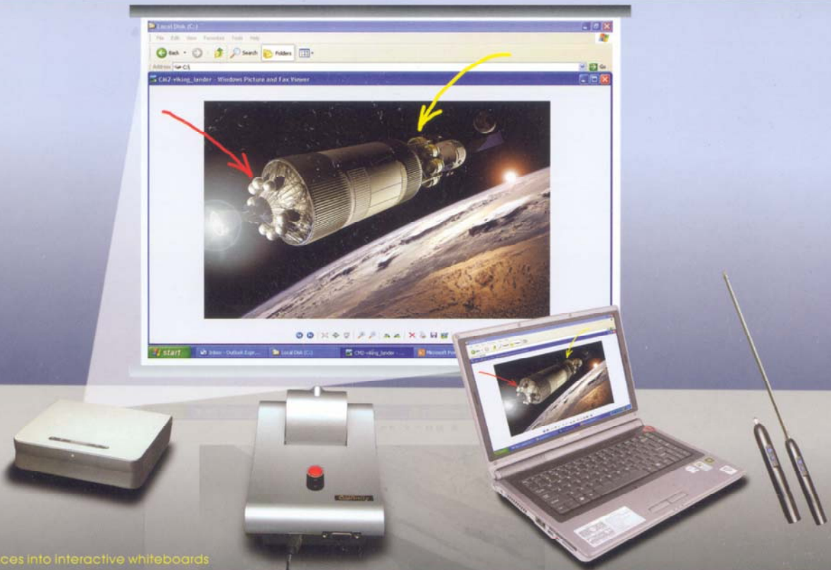
CM2 MAX can turn these surfaces into interactive whiteboards