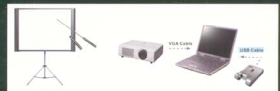
Connection used with Front Projector