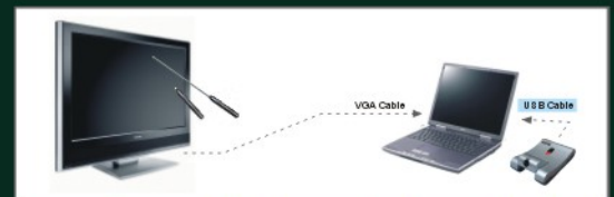
Connection used with Plasma TV or Rear Projection TV