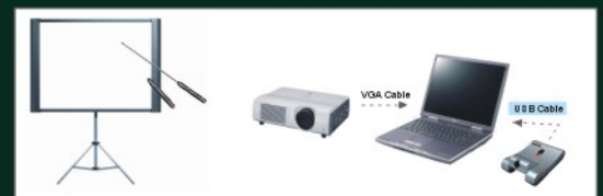
Connection used with Front Projector